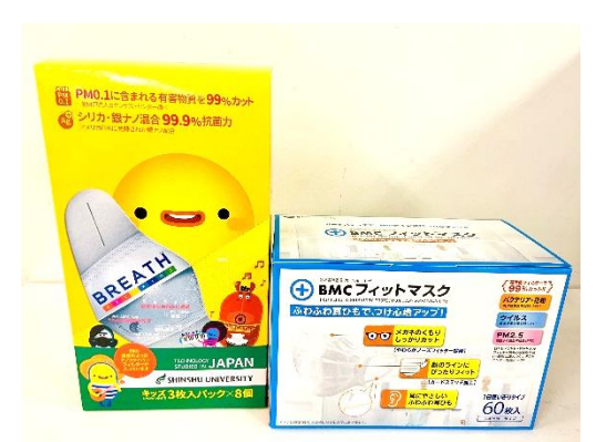
*Surgical masks that were handed out

≪Contact for information regarding this report≫ Corporate Public Relations Department, Laox Co., Ltd. TEL: 03-6852-8881